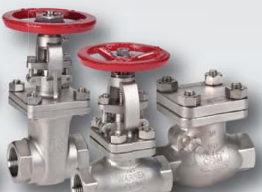
#1156-T, 2156-T, 3156-T